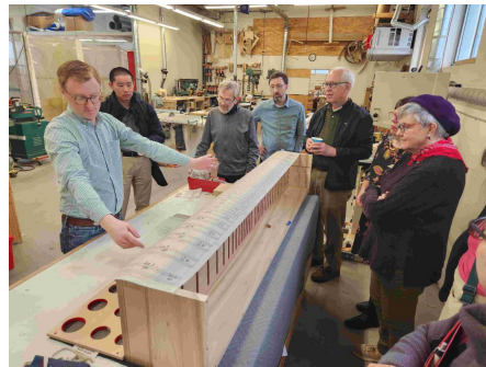
Ortloff Organ Shop Tour