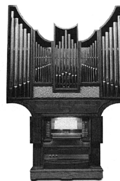
Bevilacqua Pipe Organ

From high value to high tech to handcrafted. Learn more about the profit our extended product line offers your company by calling 1-888-557-5397.