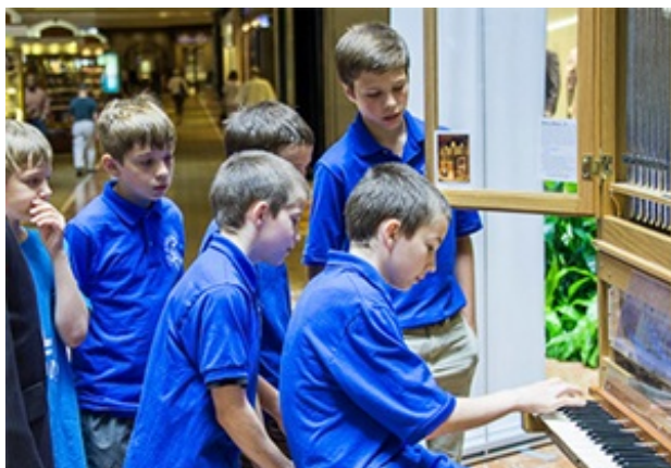
Copley Place Mall Demonstration