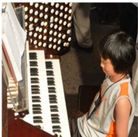
Small meets large: Open Console at Trinity Copley