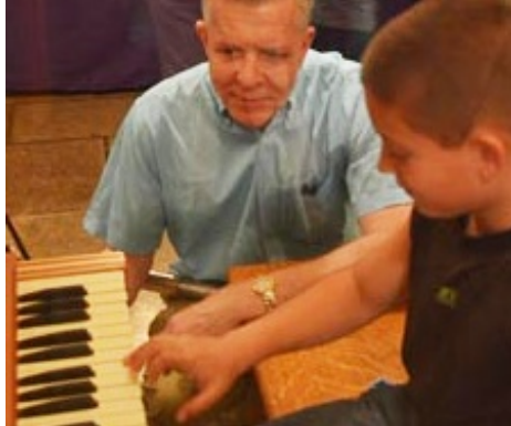
Demonstration of the portativ - all hands on (key)board