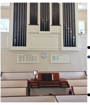
BAGO YOUNG ORGANIST INITIATIVE SCHOLARSHIP AUDITIONS

Available October 1, 2020. For more information email contact@wayneleopold.com